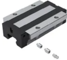
SBI 30-45 FL/FLL side grease fitting (require two FS nipple connectors)