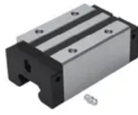
SBI SL side grease fitting