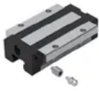
SBI 15-25 FL/FLL side grease fitting (require one FS nipple connector)