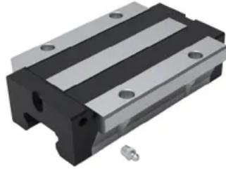
SBI 55 and 65 FL/FLL side grease fitting