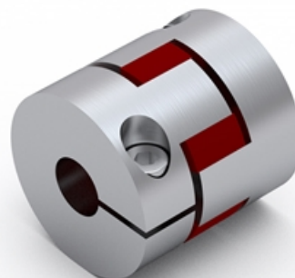
Maximum transmittable and drive torque M_{s,c} [Nm] depends on the bore diameter [mm]

The maximum transmittable torque of the clamping hub depends on the bore diameter.