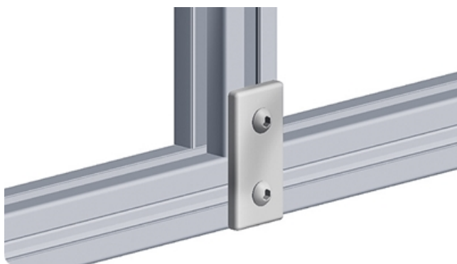
Tie plate loads